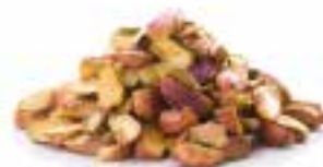
Halves &amp; Pieces