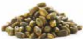
Whole Green Kernels